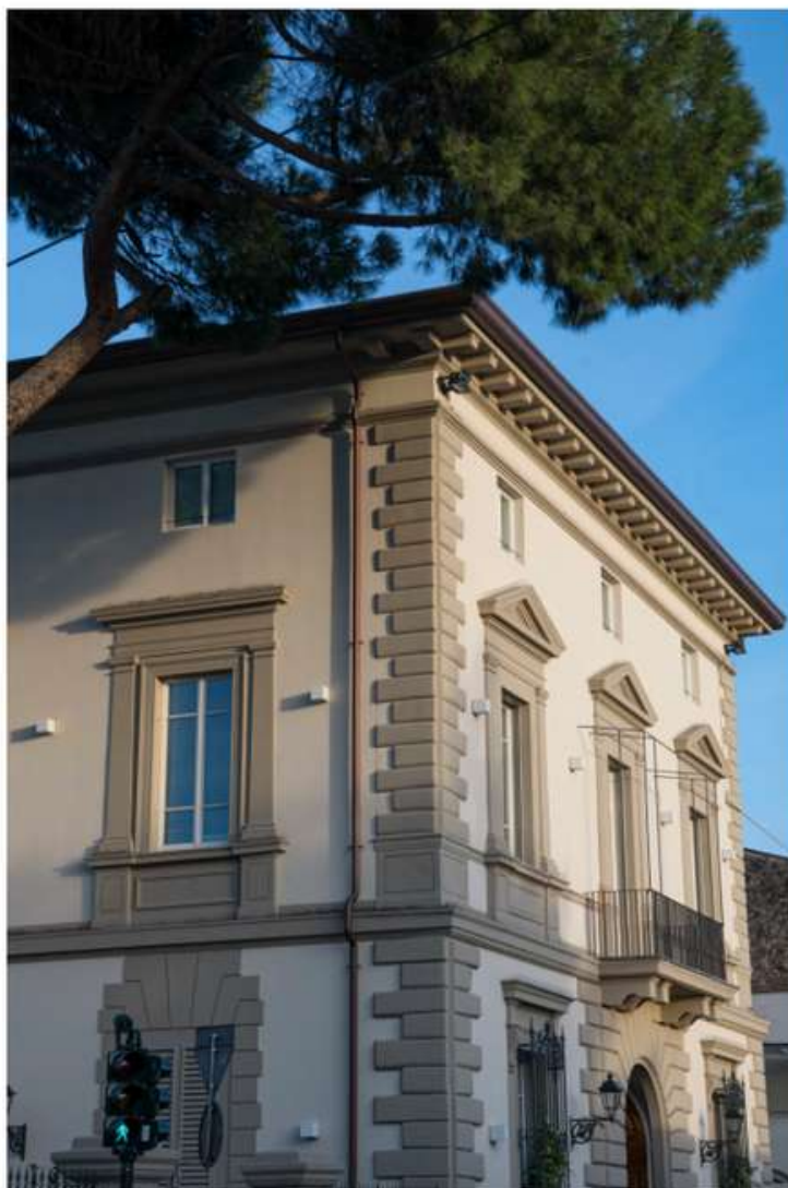
Dimora Palanca in Florence.