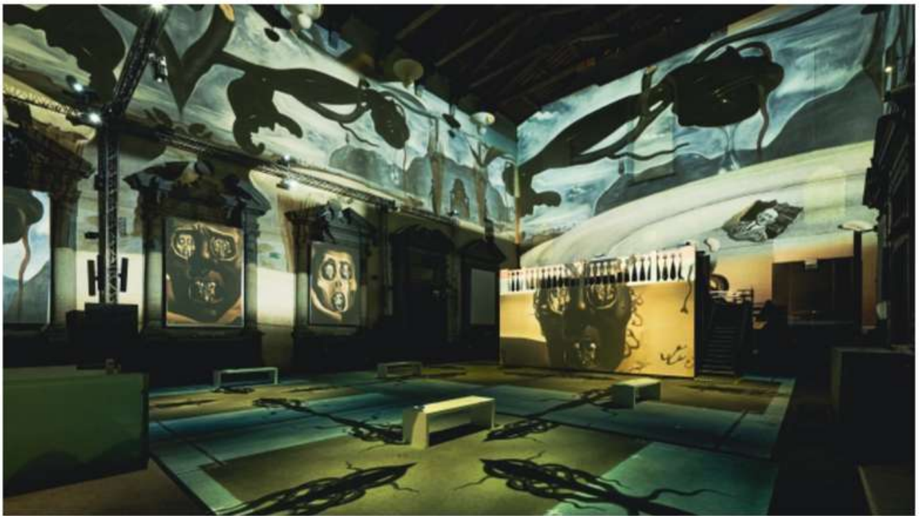
Inside the Dalí exhibition in Florence.

To celebrate the 700th anniversary of poet Dante Alighieri's death this year, the exhibition also has a dedicated area featuring 100 illustrations created by Dalí bearing the most famous passages from the Florence-born poet's masterpiece "Divine Comedy." Thanks to Dalí's art the journey from Hell to Heaven, two of the main chapters of the poem, highlights Alighieri's genius.