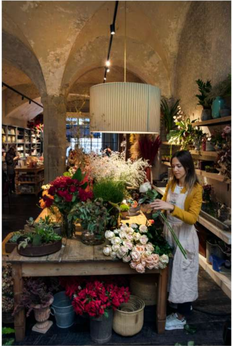
The La Ménagère flower shop.

be fascinated by the shop's selection of objects dating from early 20th century, as well as textiles and interior design pieces.