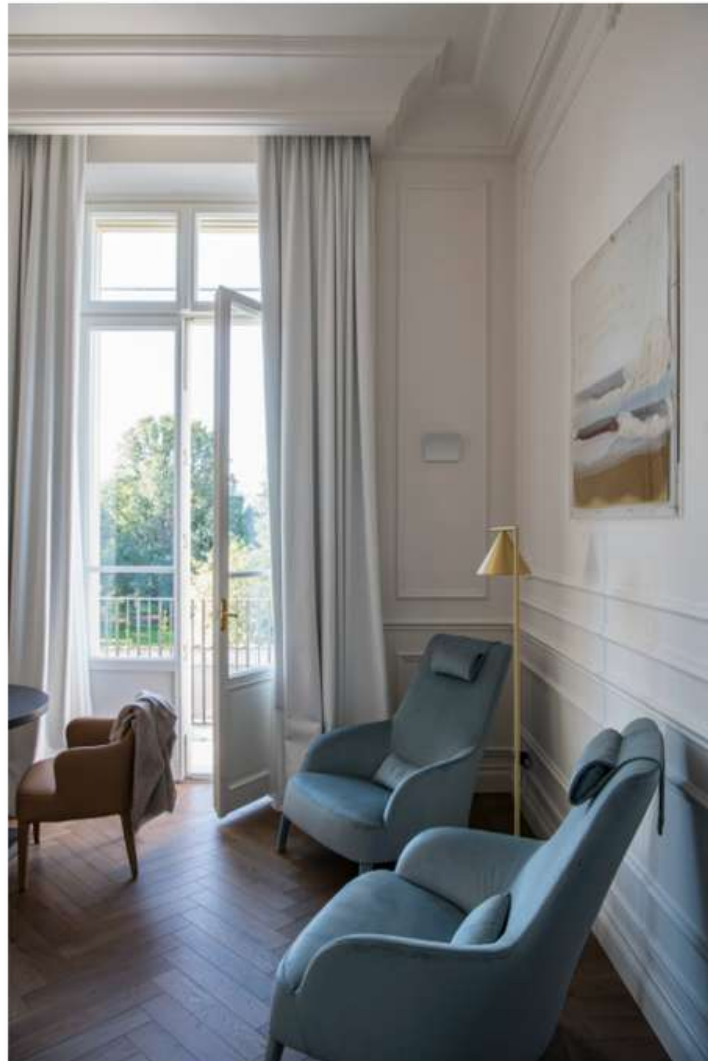
Dimora Palanca in Florence.

The villa is the heart of Dimora Palanca, which also counts a greenhouse and surrounding garden. Hotel guests can start their day with an espresso in the light-filled breakfast room overlooking the verdant garden, and later play cards or chess in the parlor and taste local cuisine made with seasonal ingredients in the Mimesi restaurant.