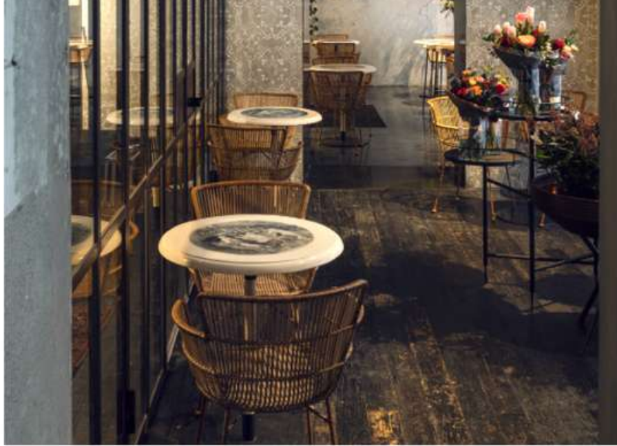
The La Ménagère cocktail bar.