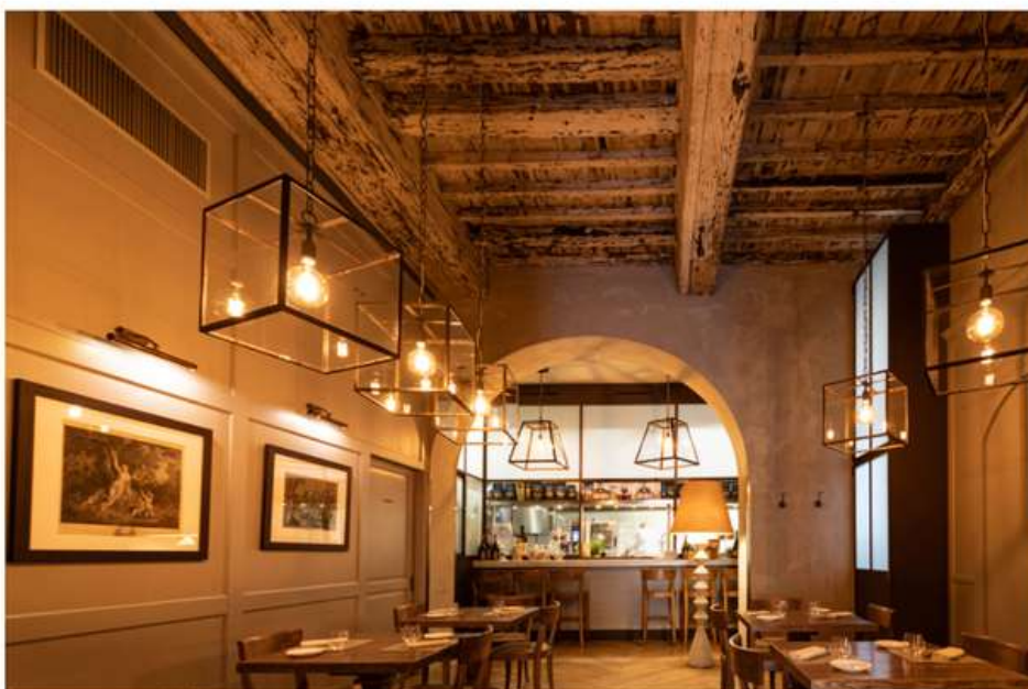
Il Borro Tuscan Bistro

The restaurant — owned by the Ferragamo family, who also runs the luxury resort “Il Borro” and two other restaurants in Dubai and London — was expanded last November with the inauguration of a new dining room.