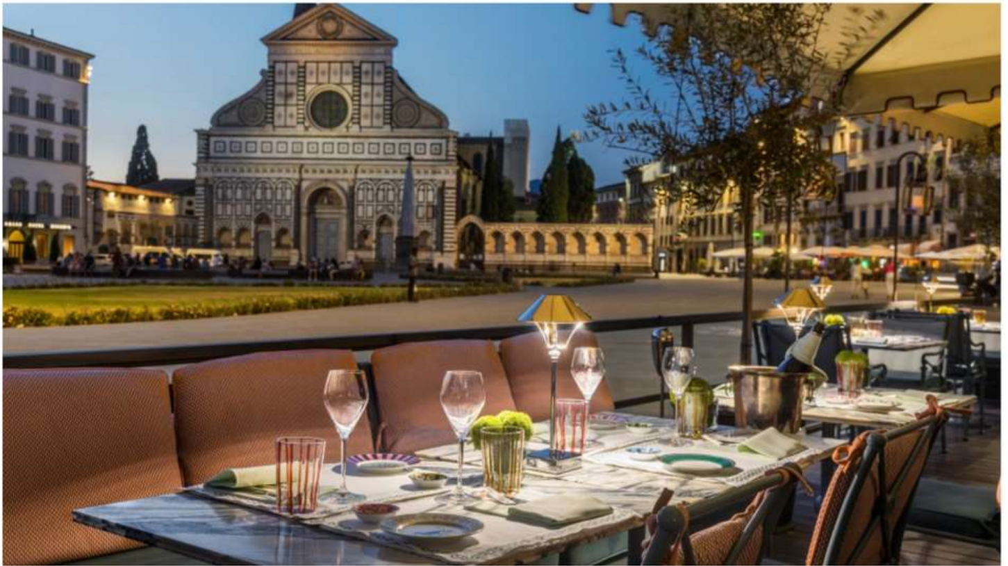
The terrace at The Place Firenze.

Even though the pandemic has not left us, Florence is proving to be a resilient city, full of new opportunities and places to discover. In between visits to the Fortezza da Basso for Pitti Uomo , running Jan. 11 to 13, there are plenty of new restaurants, boutiques, freshly revamped luxury hotels and major art exhibitions to spend one's spare time.