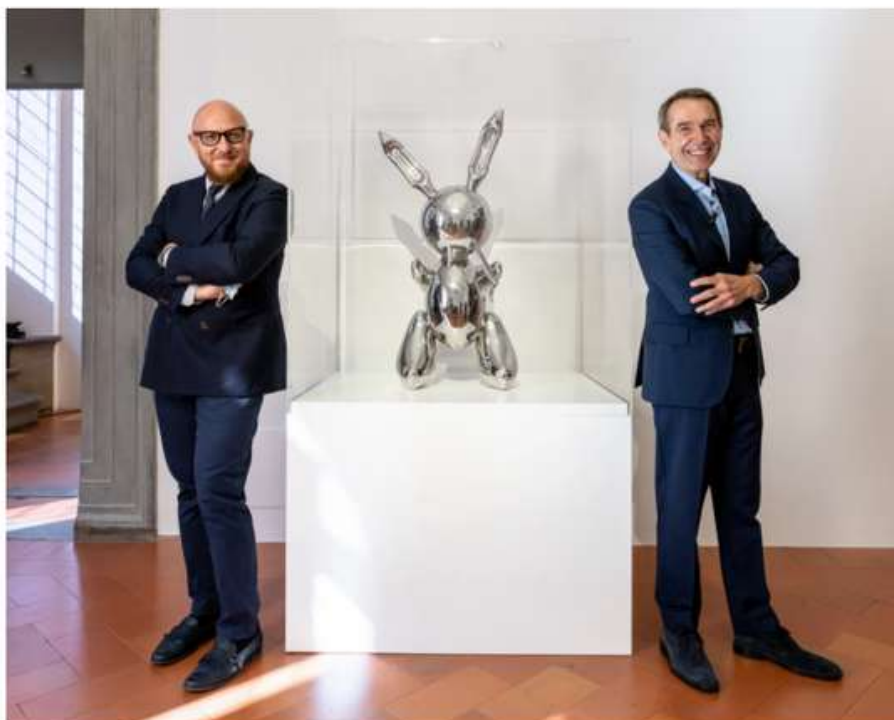
Arturo Galansino and Jeff Koons

Koons has been able to enter the collective imagination by embedding elements of pop culture, consumerism, and self-awareness into his artistic lexicon. Developed with the artist's support, the "Shine" exhibition gathers artworks from the major collections of international museums, including Koons' iconic and perfectly polished sculptures, such as the "Rabbit" and "Balloon Dog."