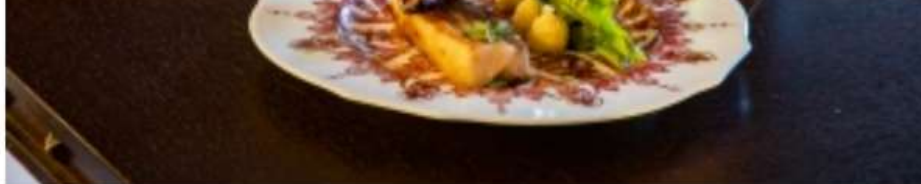
Cuisine at The Place Firenze.