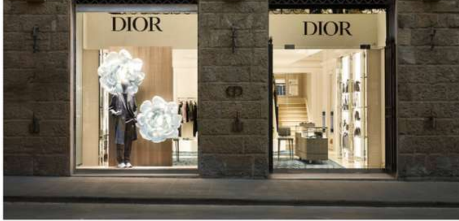
Dior men's wear boutique in Florence.

With its refined interior design featuring the brand's distinctive color palette of blue and gray, the store is located next to the Damiani flagship and opposite the Salvatore Ferragamo shop. It carries Jones' signature fashion items, from the men's version of the Saddle Bag to the running-inspired B30 sneaker, as well as his ready-to-wear collections.