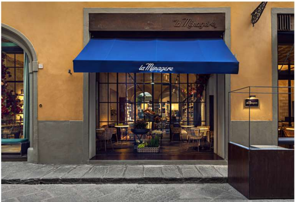
The entrance to La Ménagère.

One of the most Instagram-friendly places in town, restaurant, concept store and bar La Ménagère has been fully renovated to achieve a new look and continue to offer unconventional shopping gigs, in line with its past when wealthy Florentine families would shop there for their wedding lists and furnishing accessories that couldn't be found elsewhere.