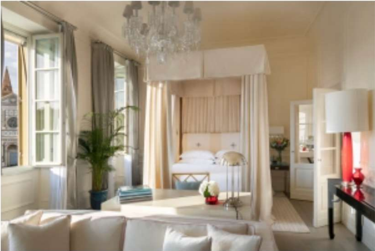
The Santa Maria Novella master room at The Place Firenze.

The Place Firenze is a luxurious yet understated hotel overlooking Leon Battista Alberti's masterpiece basilica Santa Maria Novella, surrounded by such landmarks as the Museo Novecento, the Antica Profumeria Santa Maria Novella and the cinema Ariston.