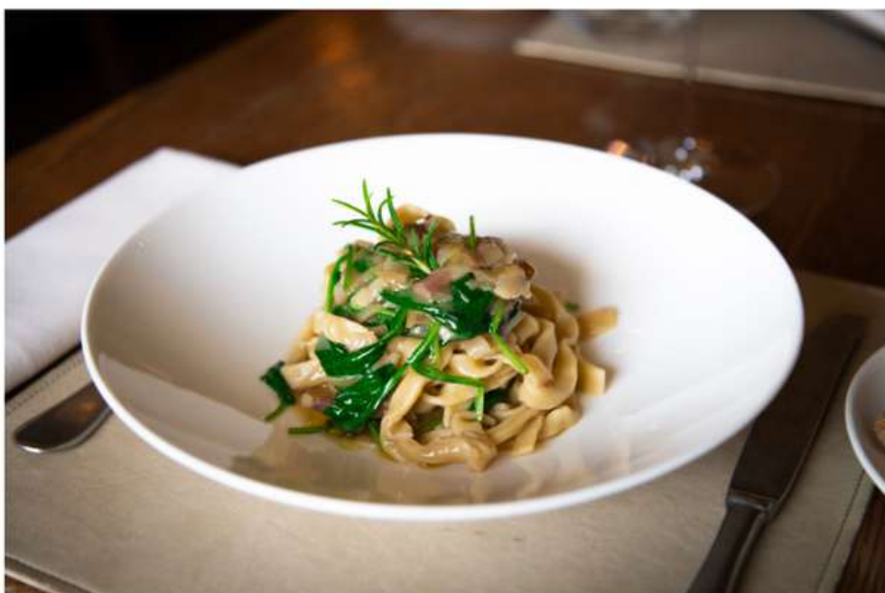
Cuisine at Il Borro Tuscan Bistro.