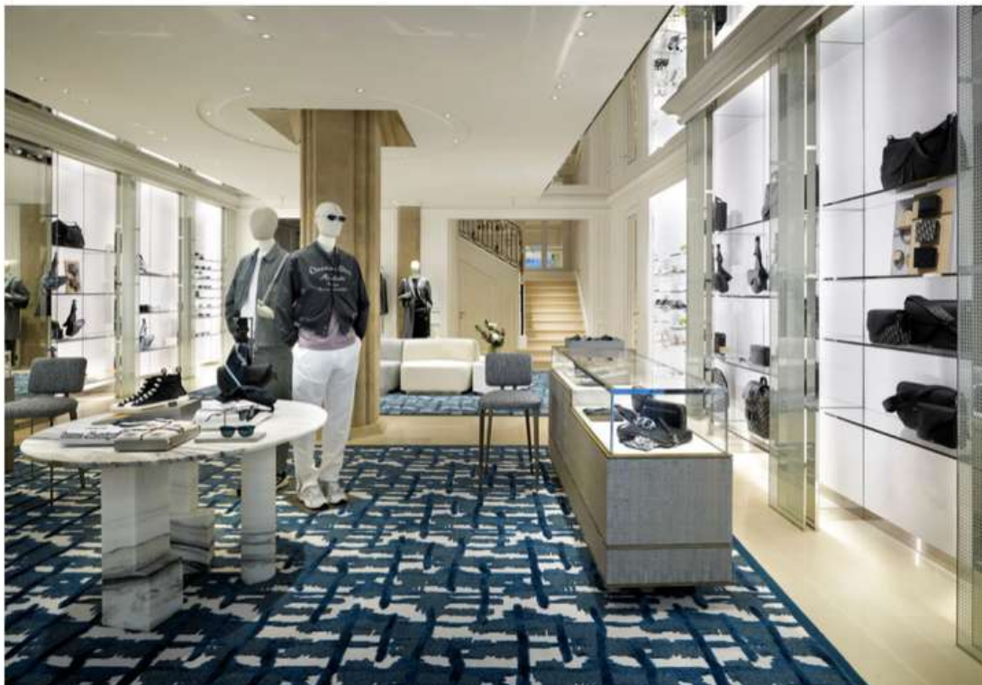
Dior men's wear boutique in Florence.

The luxury French brand, part of LVMH Moët Hennessy Louis Vuitton, has another store in the city dedicated to its women's wear designed by Maria Grazia Chiuri, located on Via degli Strozzi, 17.