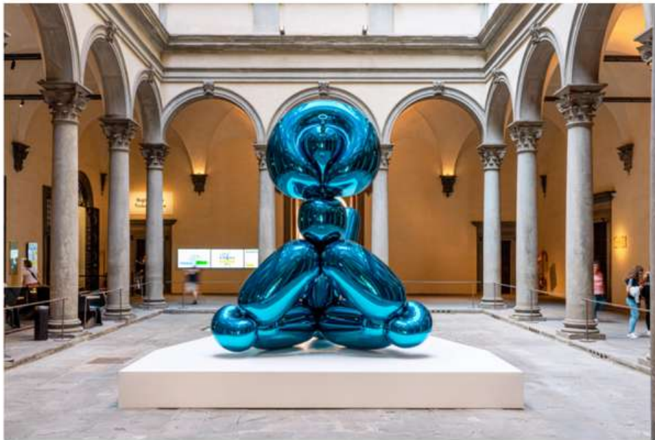
Jeff Koons' "Shine" exhibition.

Koons has been able to enter the collective imagination by embedding elements of pop culture, consumerism, and self-awareness into his artistic lexicon. Developed with the artist's support, the "Shine" exhibition gathers artworks from the major collections of international museums, including Koons' iconic and perfectly polished sculptures, such as the "Rabbit" and "Balloon Dog."