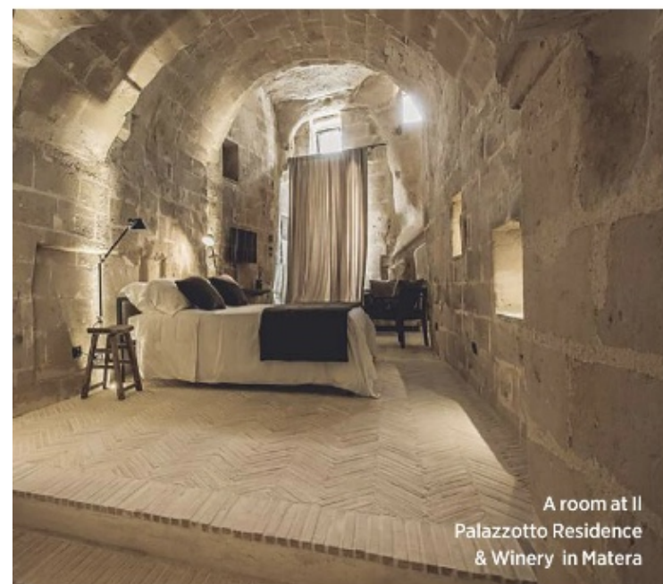
A room at Il Palazzotto Residence & Winery in Matera