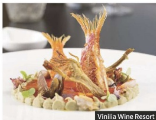
Vinilia Wine Resort