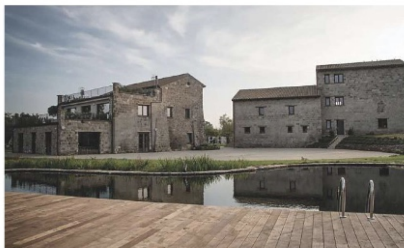
Above right: guest houses at I Cacciagalli in Campania