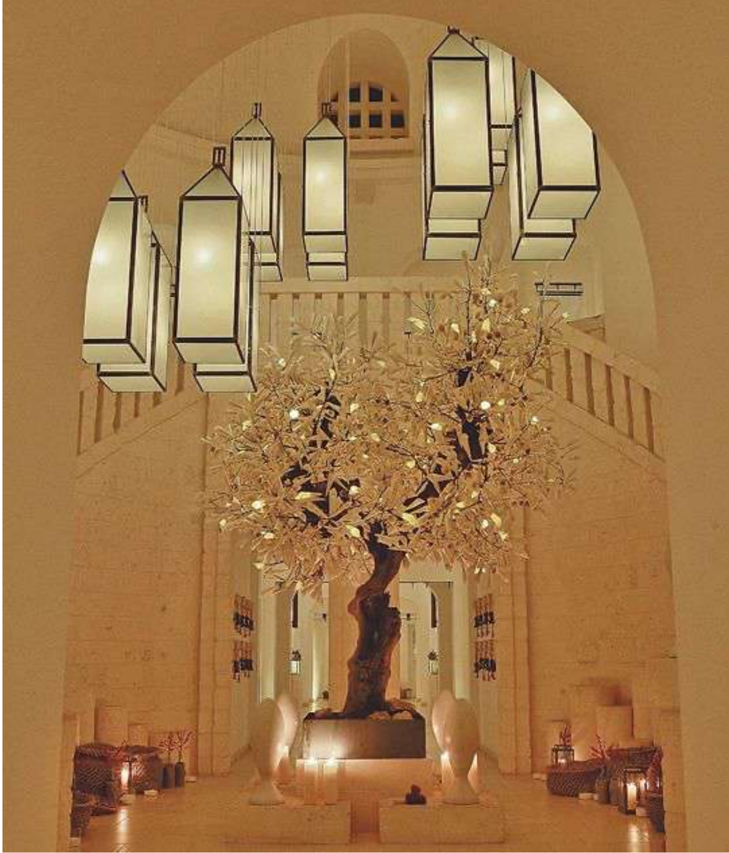
Borgo Egnazia Tree.

Opened in 2010 from the visionary project of Pino Brescia, a local designer who brought to life a concept created by the Melpignano family, Borgo Egnazia is a tribute to traditional architecture which incorporates materials (local stone and hand-cut "tufo" stone), and features such as small windows and porches typical of the region. Borgo Egnazia is divided into three places to stay: La Corte, the traditional main building, with 63 rooms; The Borgo, the heart of the property with its entrance arches, narrow streets with Apulian names, the bustling square, fountains and the iconic clock tower, and 92 "casette" (townhouses); and finally there are 23 villas with private gardens and pools that are perfect for families and for those who want absolute privacy.