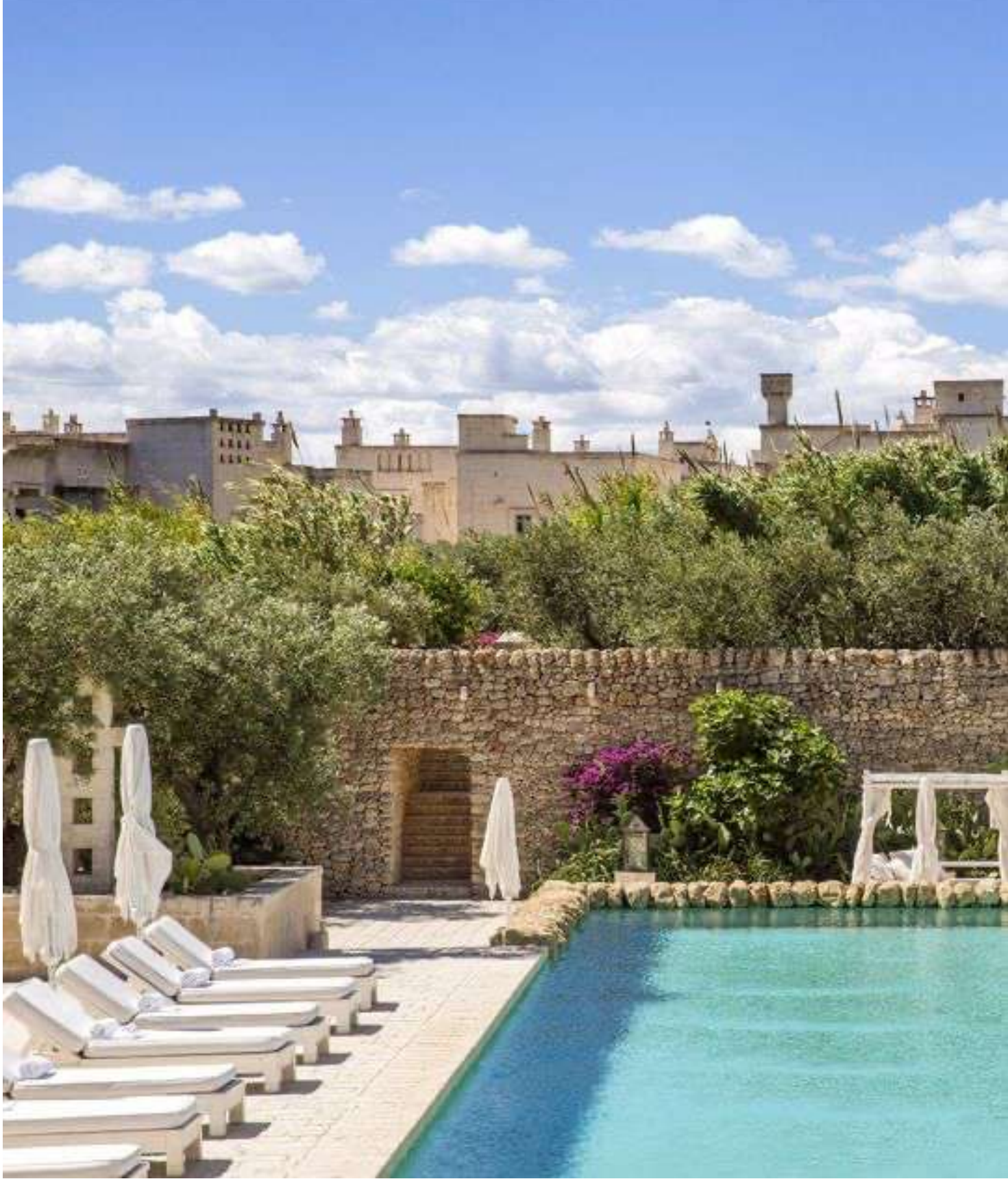
La Corte Pool.