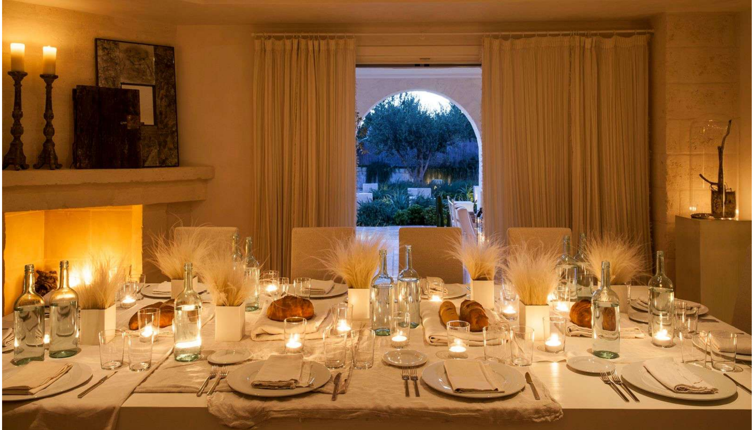
Dinner Area in a Villa inside Borgo Egnazia.

The beautiful Borgo Egnazia Hotel , located in Savelletri di Fasano, Puglia, where the hills of the Itria Valley gently fall in the Adriatic sea, is considered one of the most charming hotels of Italy. The property itself is inspired by the shapes, materials and colors of a typical Apulian village. This authenticity was conceived to bring a fresh and original feel that is found 'nowhere else', alongside impeccable service. A miniature world of homemade breakfasts prepared by Apulian "Massaie" , a revolutionary spa, two beautiful private beaches and the scenic San Domenico Golf surrounded by ancient olive trees with views that stretch to the sea. And then there's the service; tailored, friendly and caring, a dedicated team always available to guests, and the delicious gourmet menu crafted by Domenico Schingaro and finally, there is the incomparable beauty of the Apulian countryside.