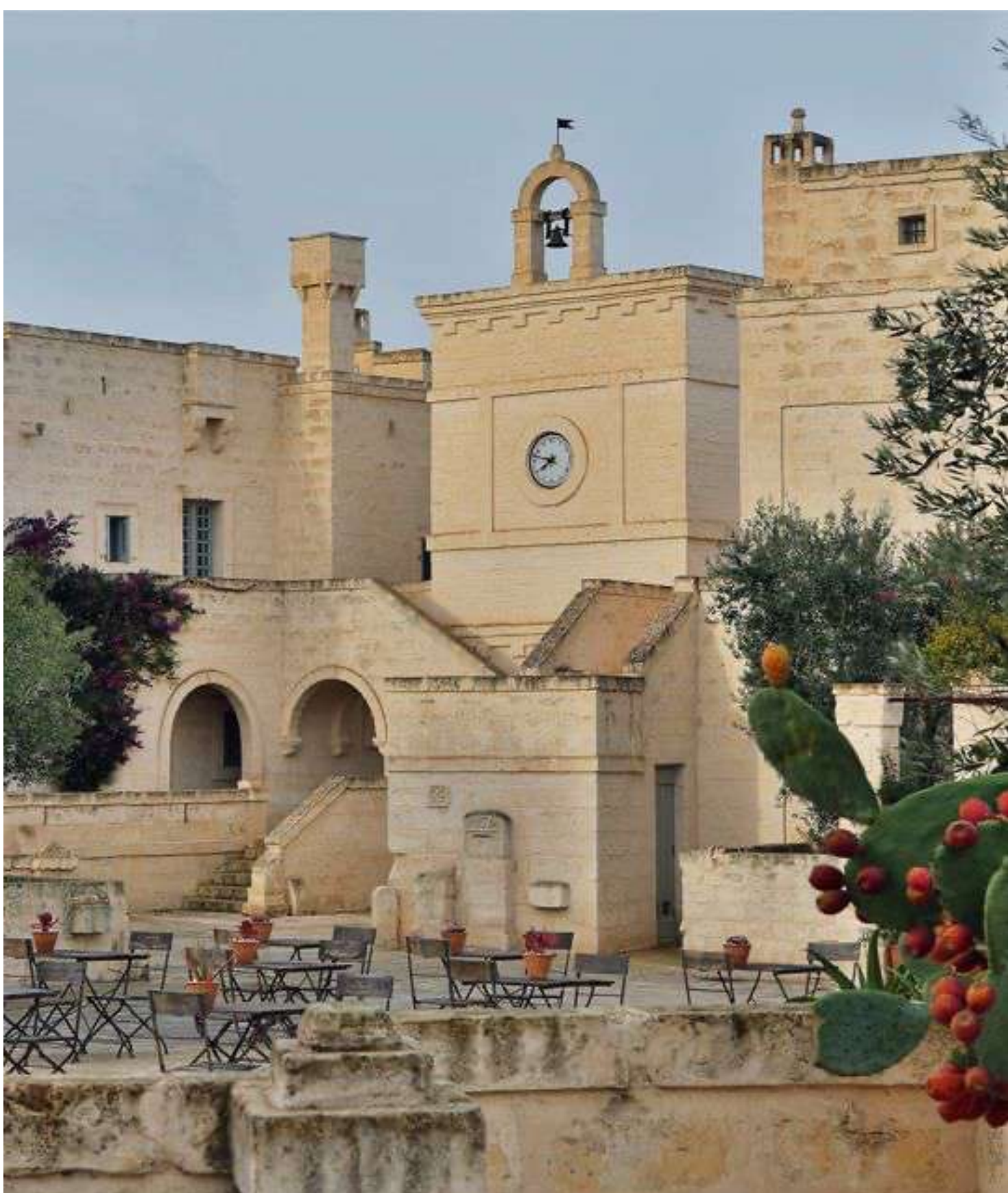
La Piazza of Borgo Egnazia.

Live a breathing tale of Puglia, spoken by the ancient culture of the land and by the sheer beauty of the unique architecture of Borgo Egnazia, in Savelletri di Fasano, a luxurious citadel where to relax and enjoy the true essence of Italian Beauty.