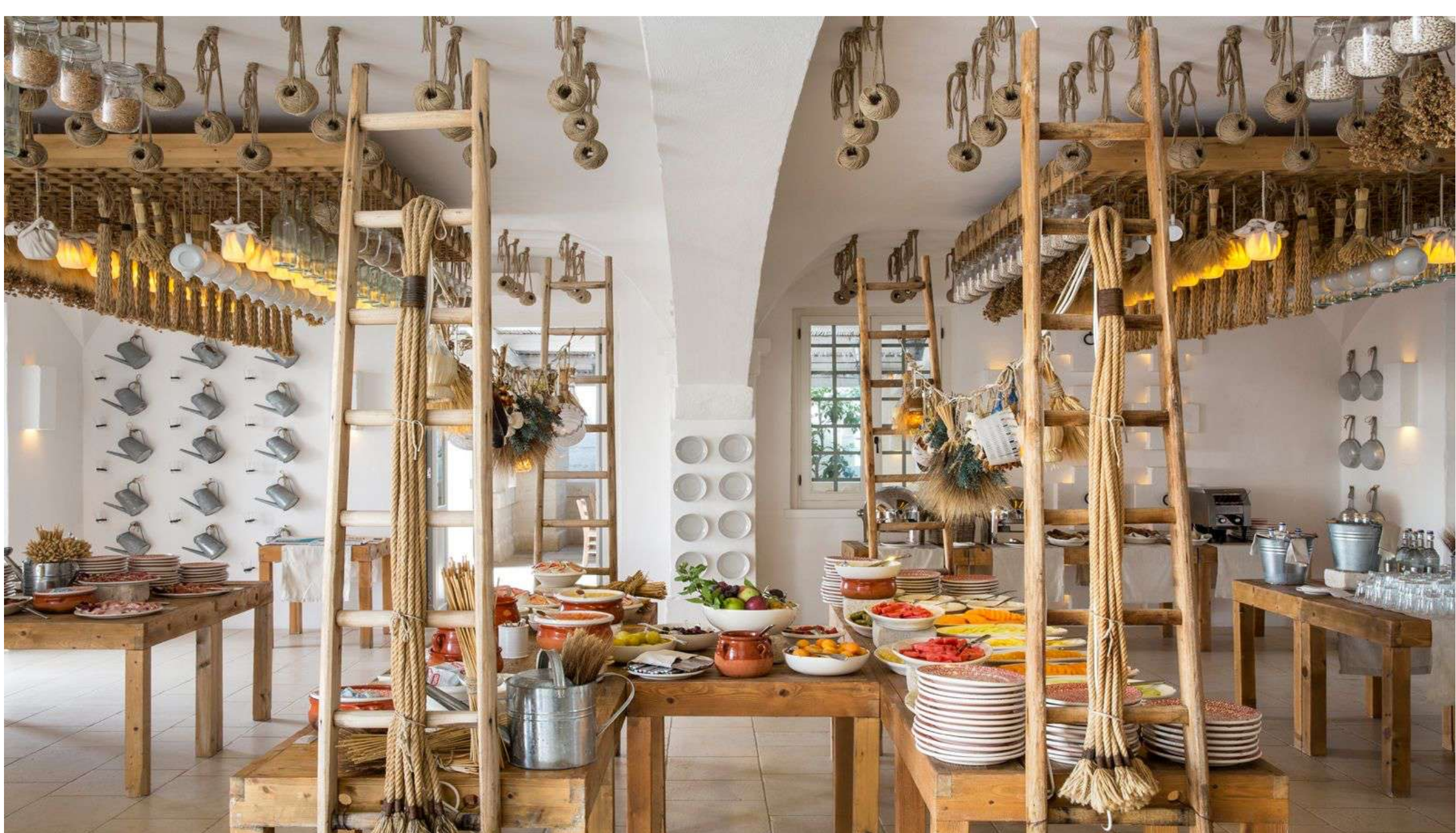
La Frasca Restaurant.