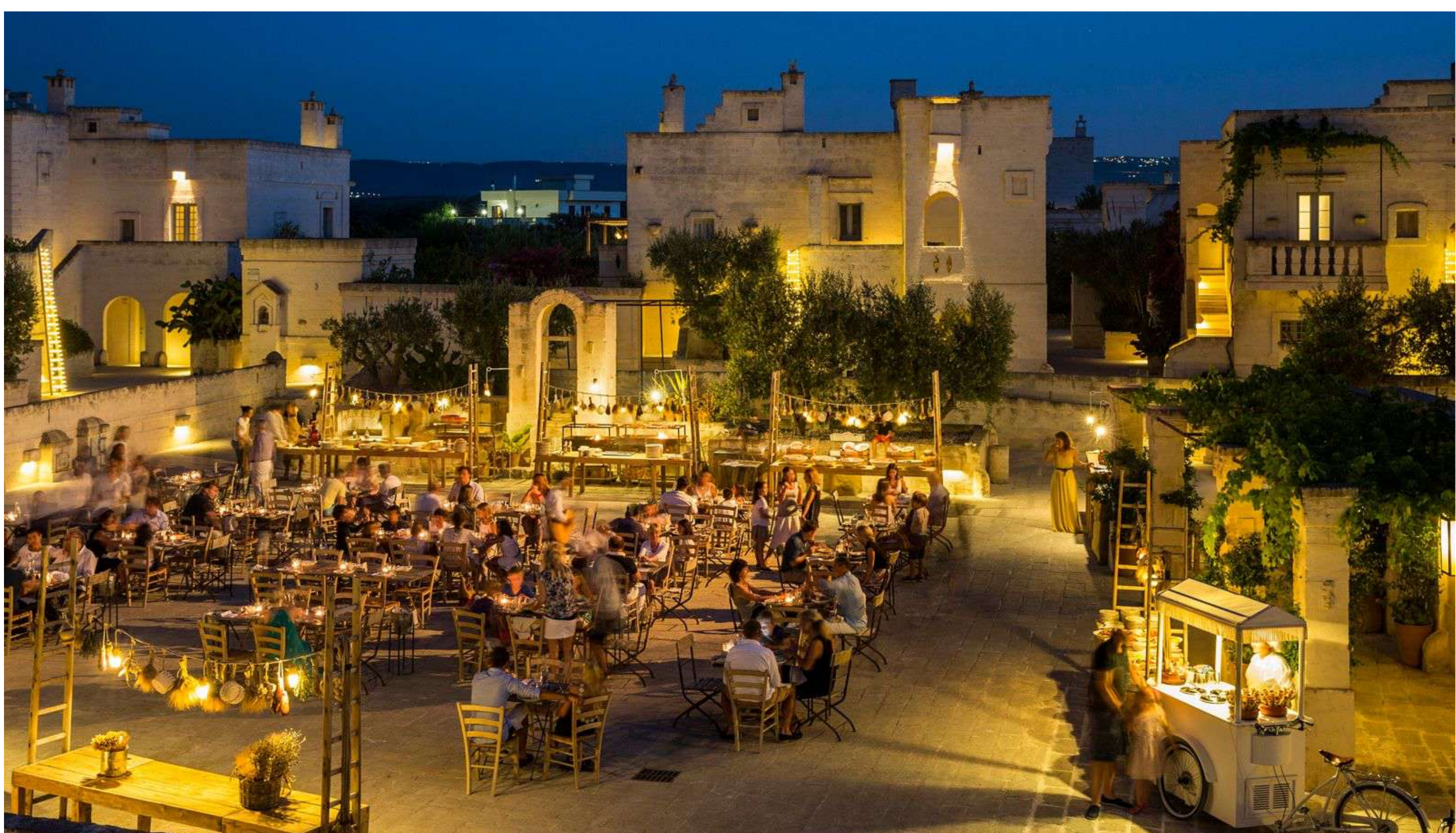
La Piazza Of Borgo Egnazia during a Summer Party.

Vair means 'true' in Apulian dialect, and it is this 'true wellbeing' that is found at Vair Spa, a temple dedicated to the care of body and soul set within 2,000 sqm in Borgo Egnazia. All of the Vair spa experiences have names in dialect, strengthening their intimate connection with Apulian tradition.